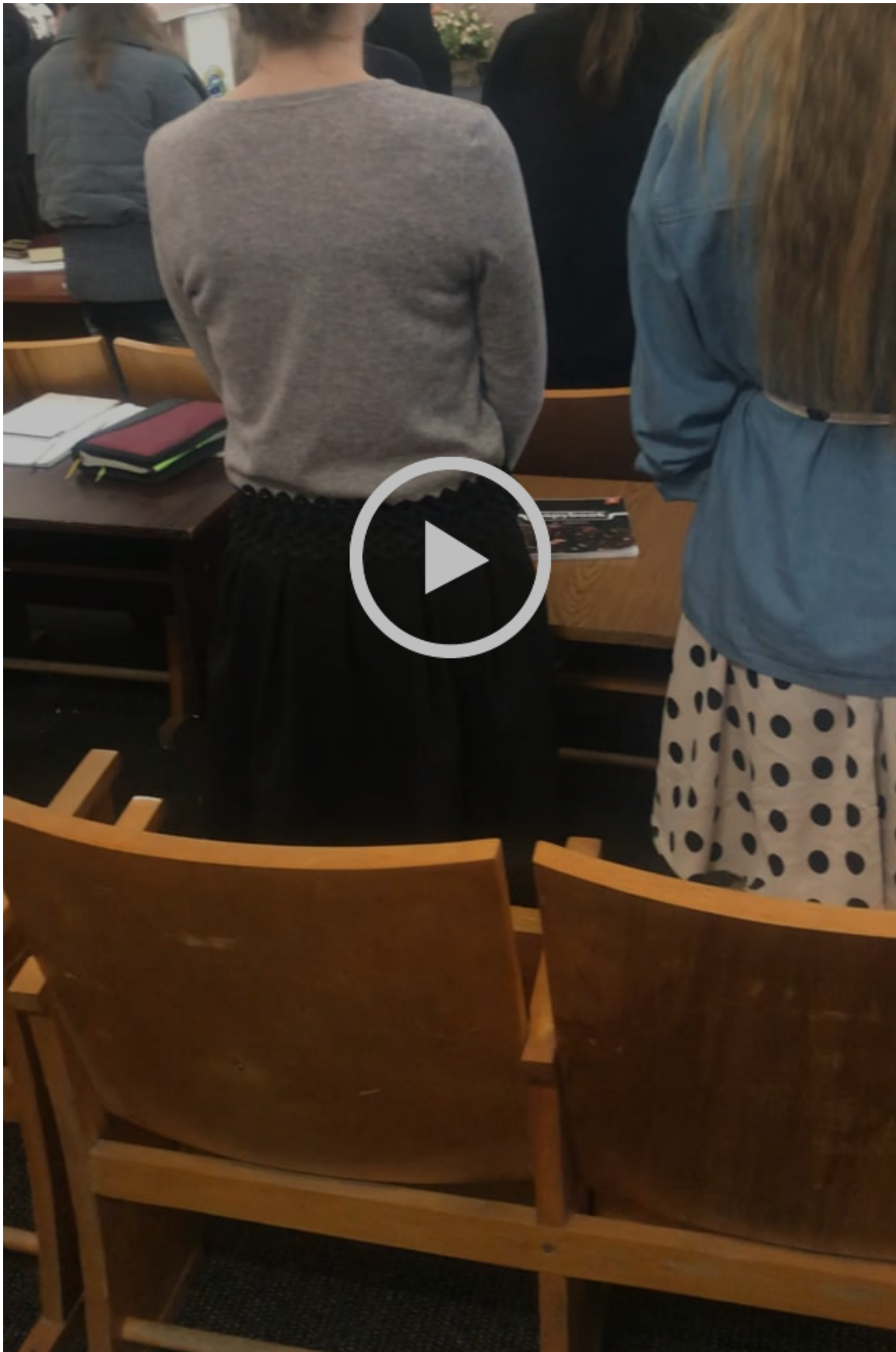
Congregational singing during our closing service. Do you recognize the song we're singing?