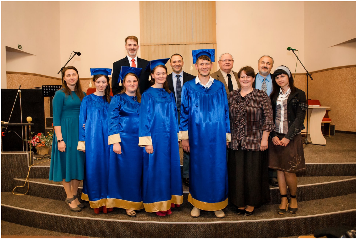
Slavic Baptist Institute's graduating class 2019 with staff.