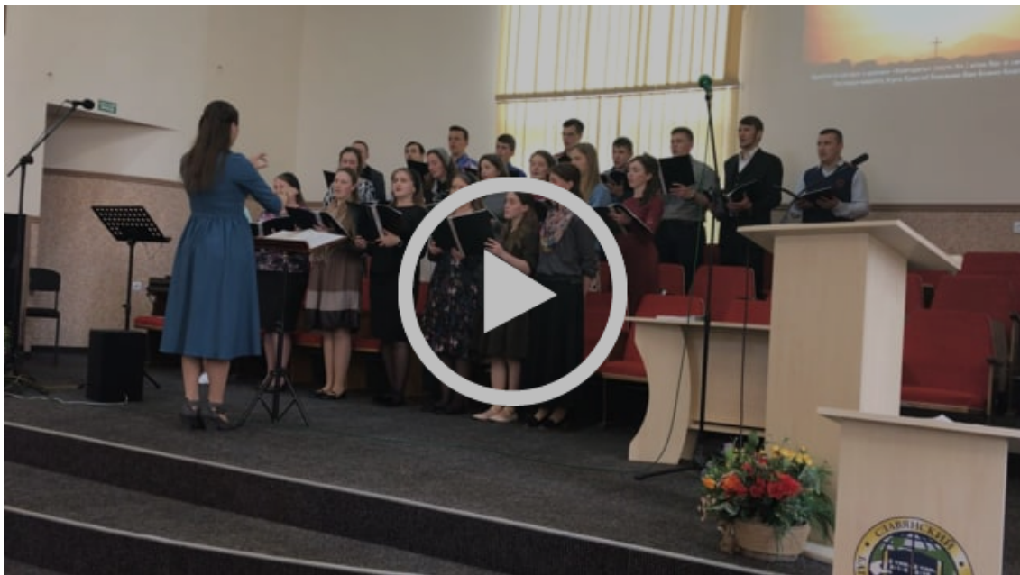
SBI Choir singing during a chapel service of our Spring session. They are singing praise or glory to the One who is risen.