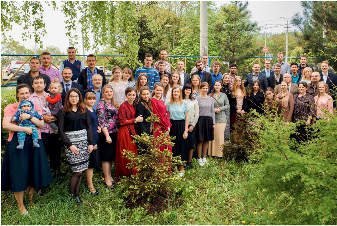
Spring Session 2019 Student Body and Staff (including two of our newest students on the front left who attended with momma and papa).