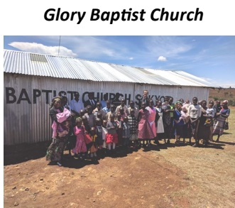
Glory Baptist Church