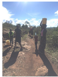
Walking back to the church with the water