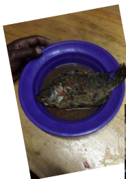
Samaki and Ugali !