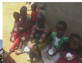
Waiting for morning chai (tea)