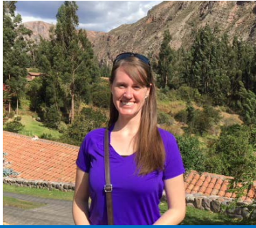
Fellow Missionary ~Highlight