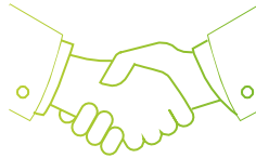
Sales and customer management