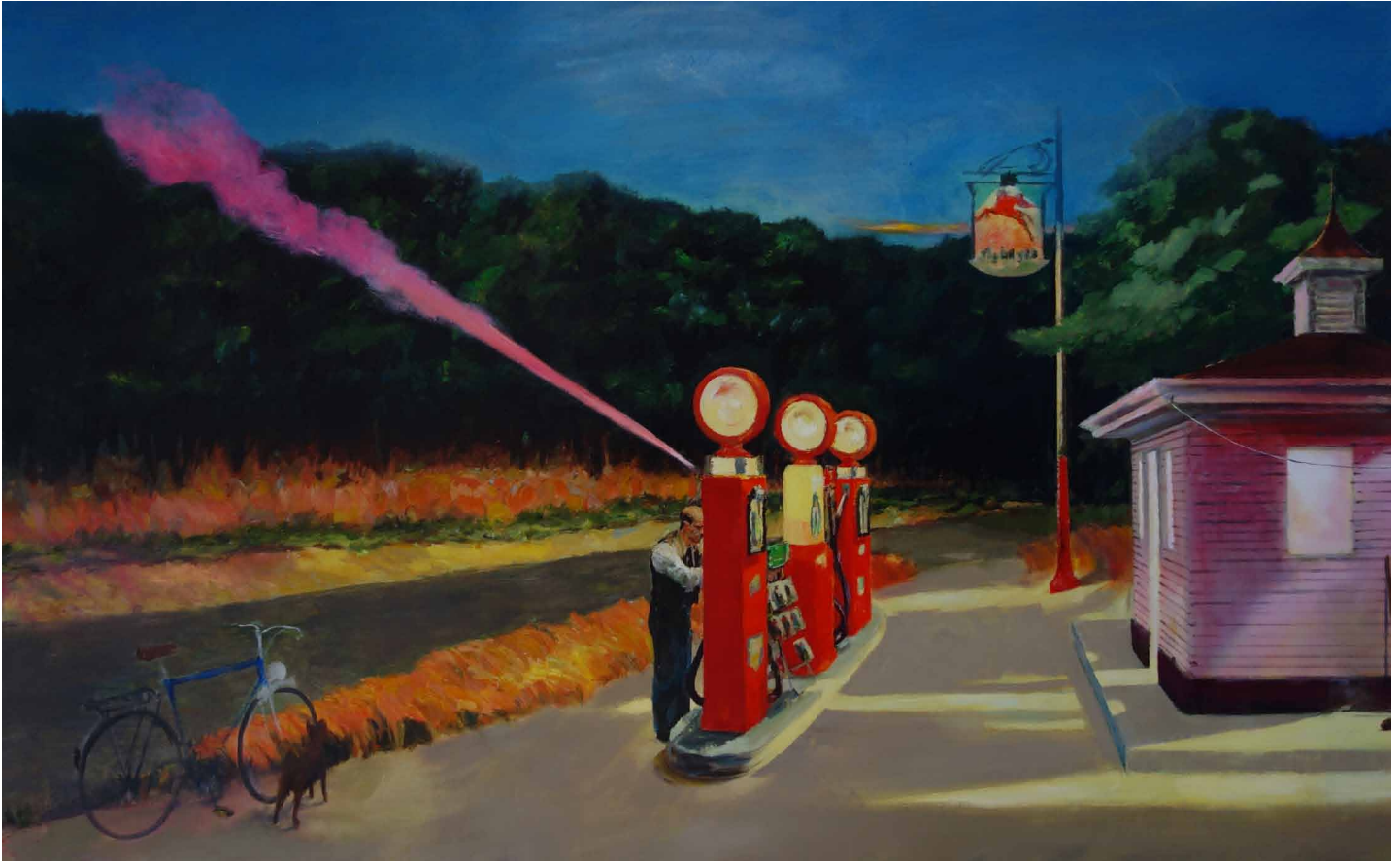
„UFO Sighting“ (referring to Hopper) Öl auf Leinwand / oil on canvas 95 x 150 cm 2017