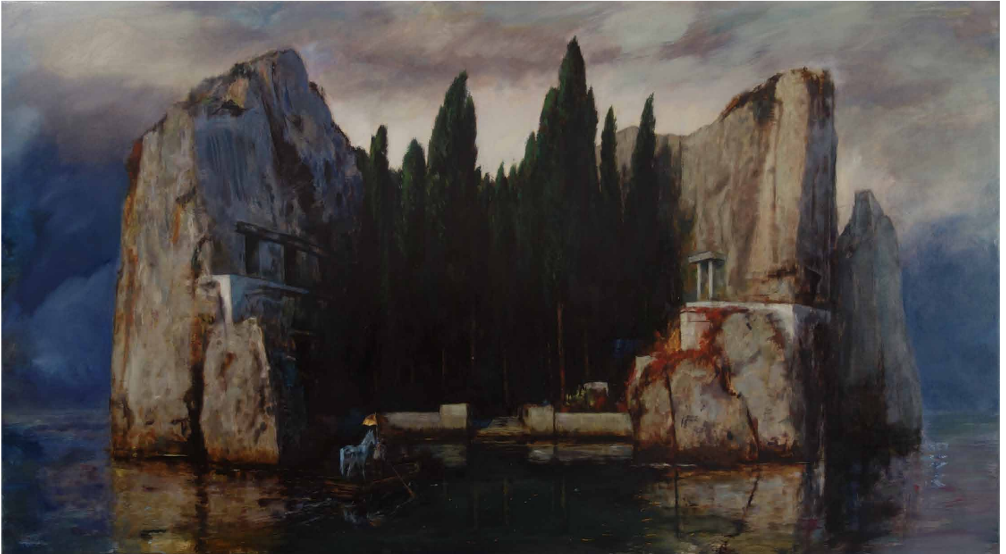
„Heimkehr“ (referring to Böcklin) Öl auf Leinwand / oil on canvas 95 x 180 cm 2017