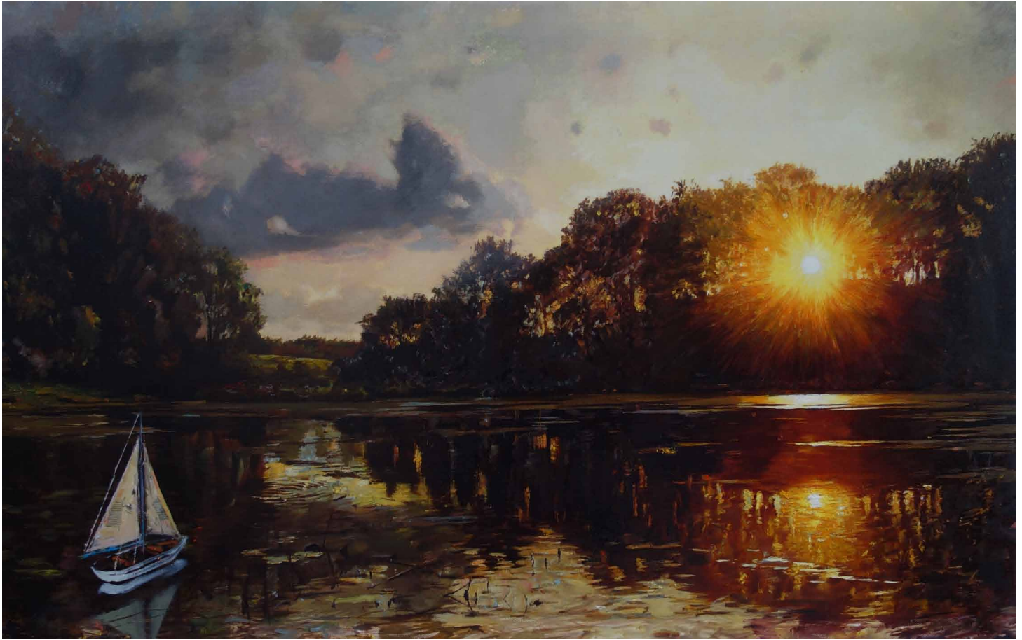
„ Sailing “ (referring to Mønsted) Öl auf Leinwand / oil on canvas 95 x 60 cm 2017