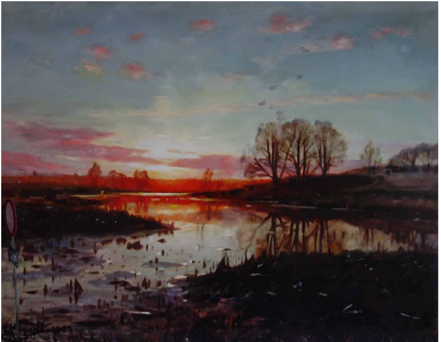
„Ende der Ausbaustrecke“ (referring to Mønsted)