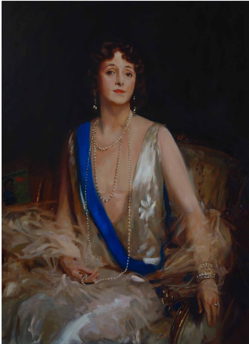
„ Rock Your Baby “ (referring to Sargent) Öl auf Leinwand / oil on canvas 130 x 95 cm 2017