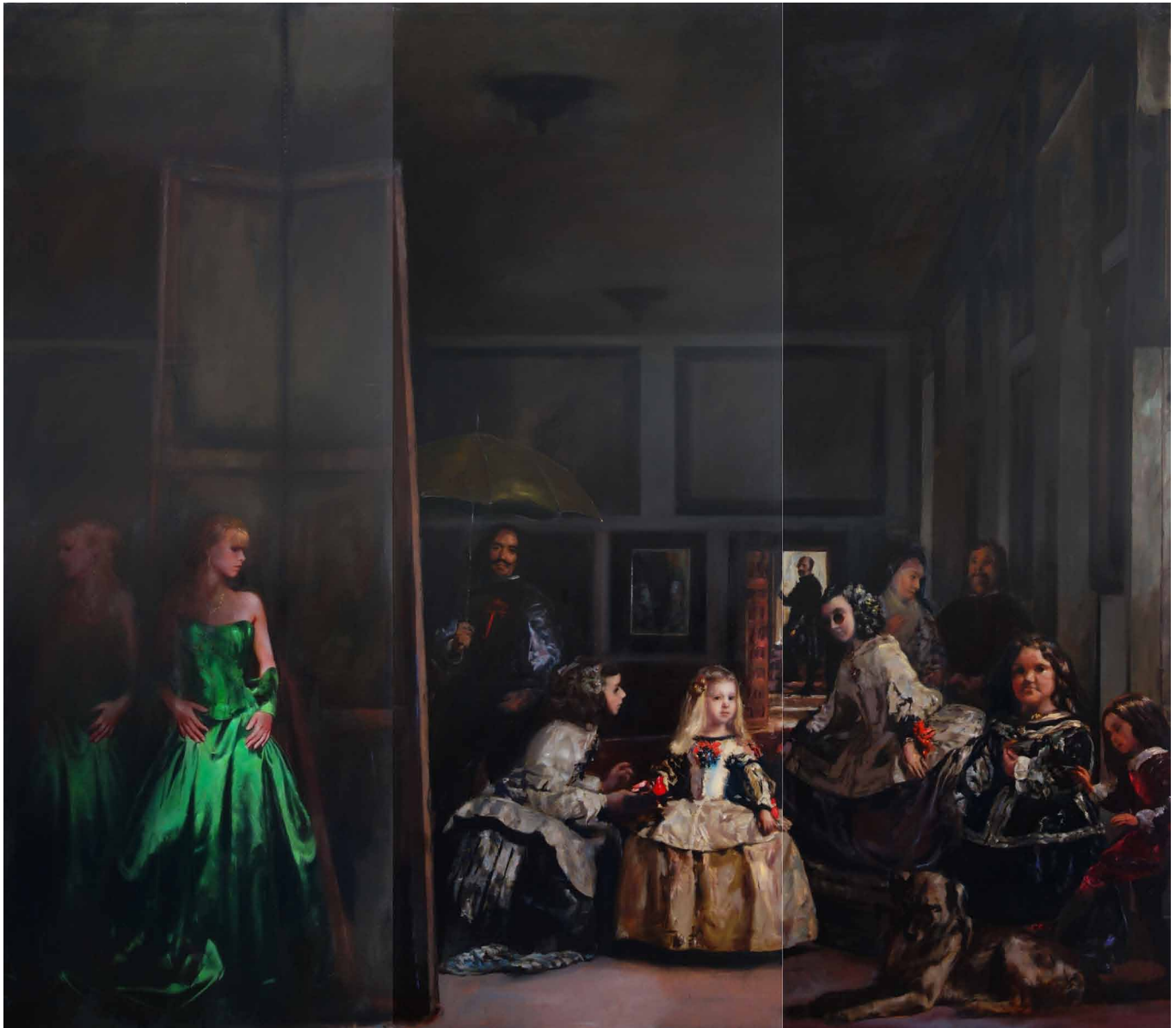
„ Silent Green “ (referring to Velazquez)