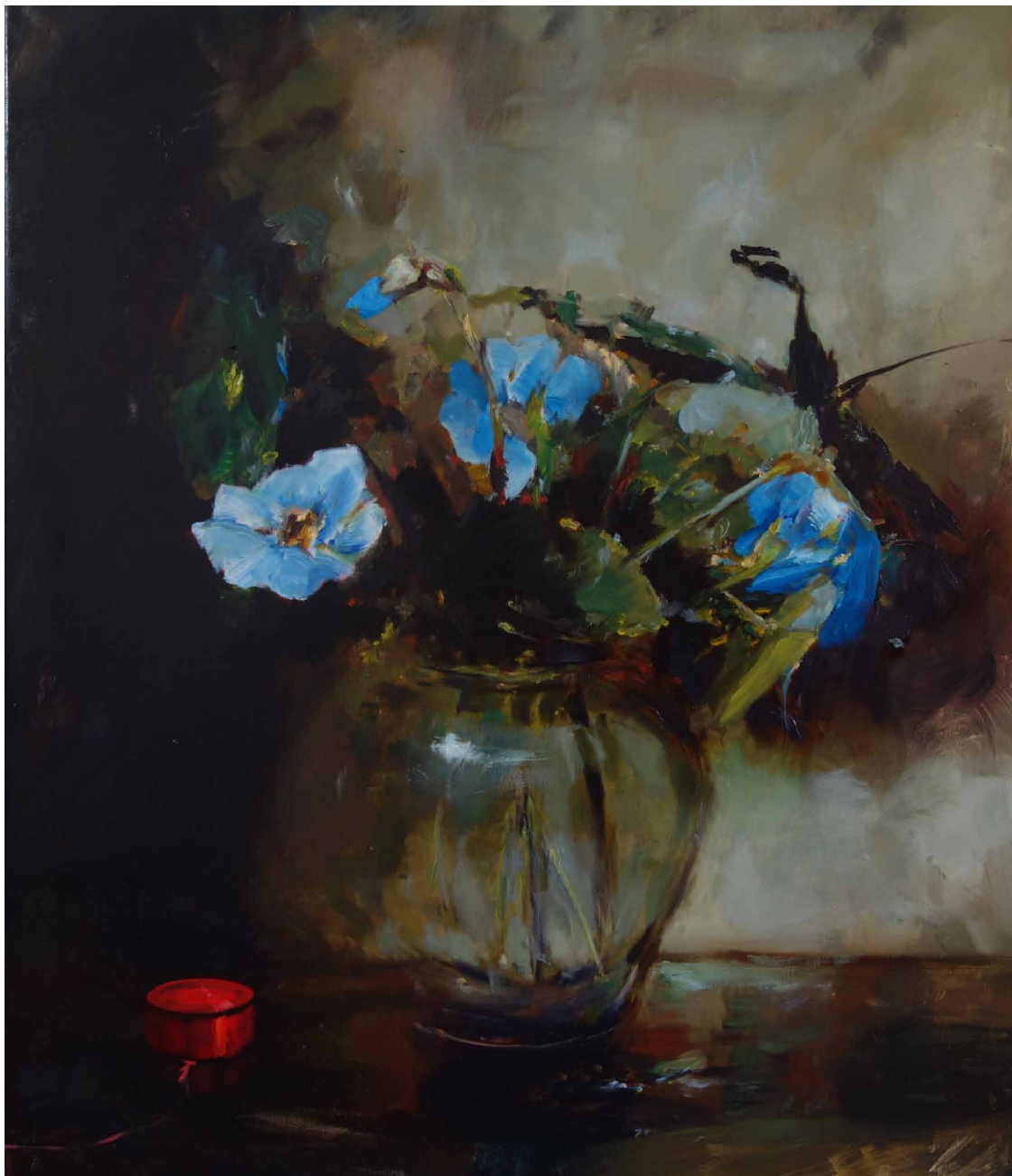
„Google Bomb“ (referring to Lipking) Öl auf Leinwand / oil on canvas 60 x 50 cm 2017