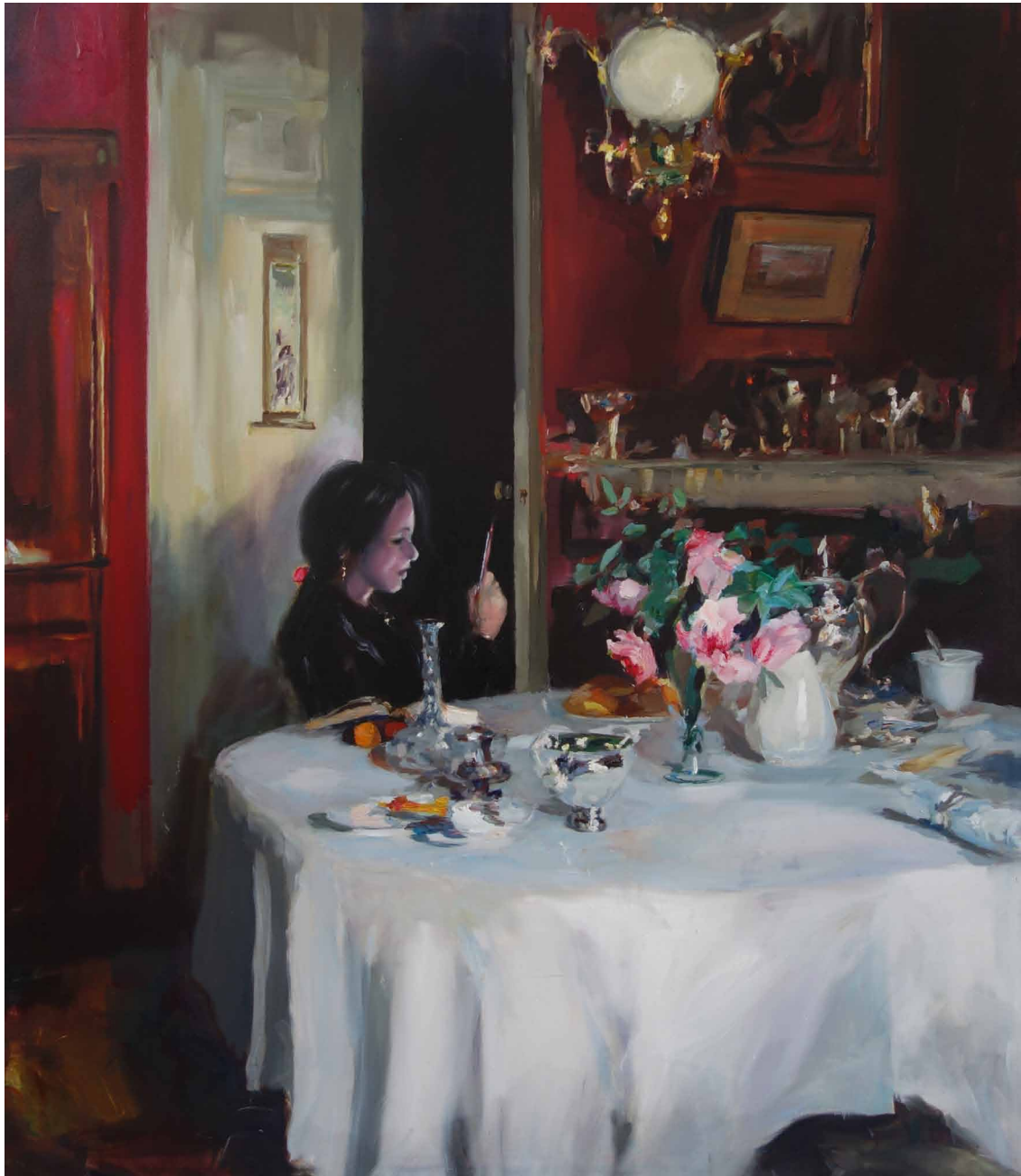
„Breakfast Trap“ (referring to Sargent) Öl auf Leinwand / oil on canvas 100 x 100 cm 2017