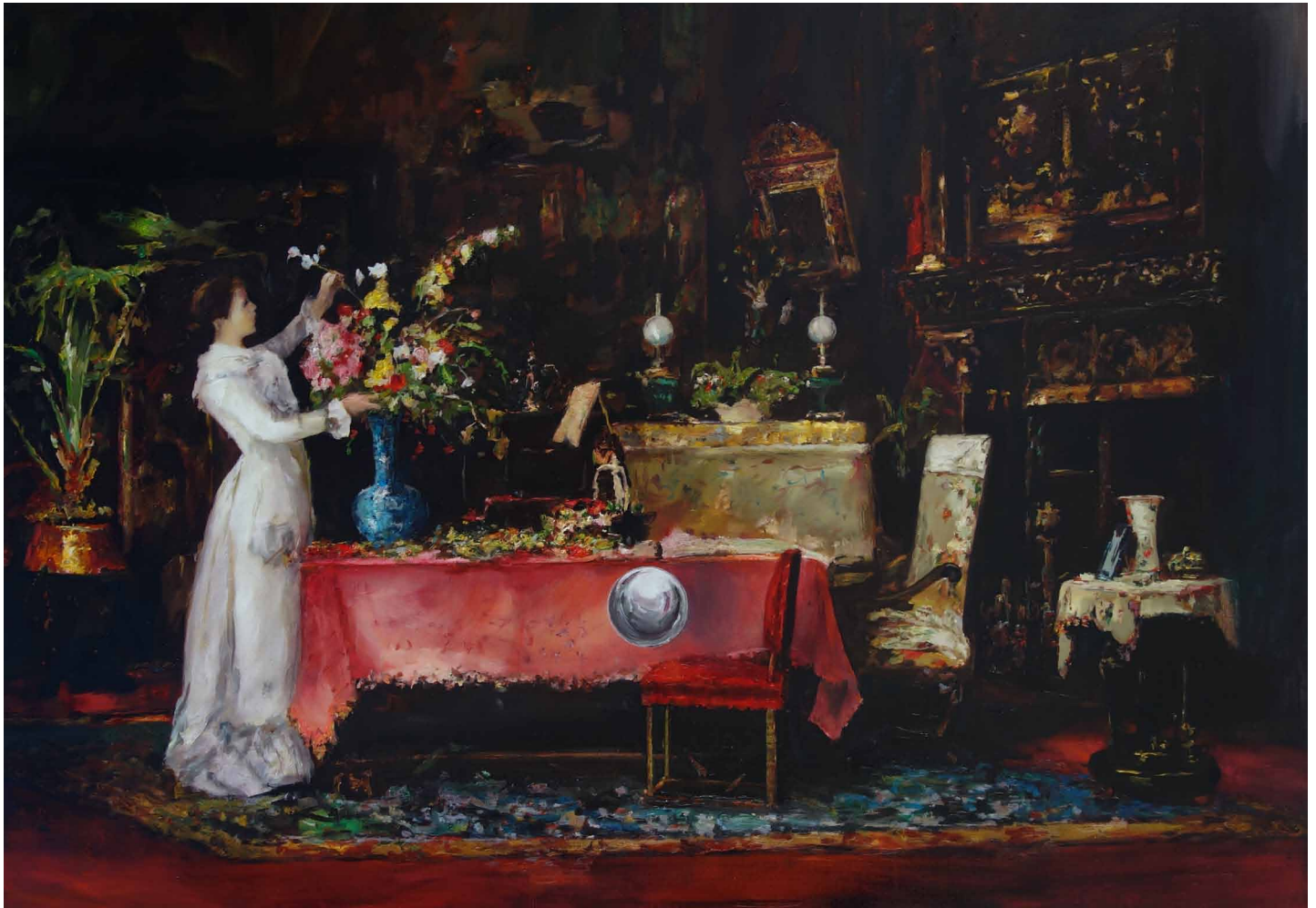
„The Old Way“ (referring to Munkascy) Öl auf Leinwand / oil on canvas 95 x 130 cm 2017