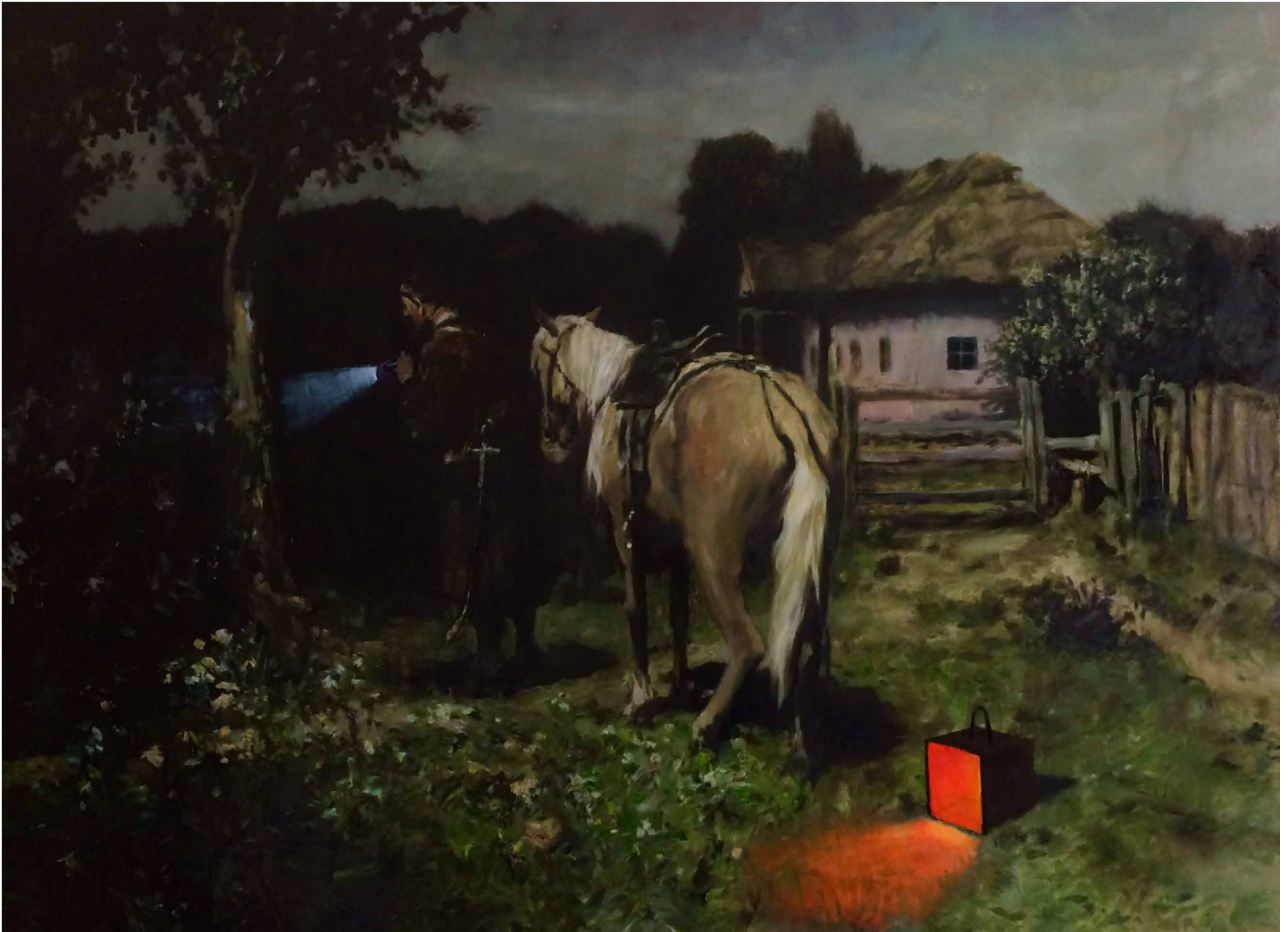
„ Lichterspiel “ (referring to Pymonenko) Öl auf Leinwand / oil on canvas 95 x 130 cm 2017