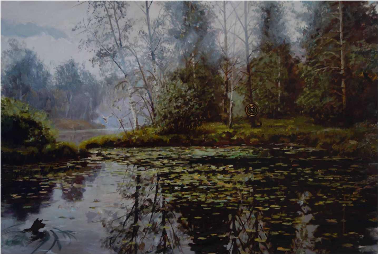
„Ein Ziel im Leben“ (referring to Xudozhnik)