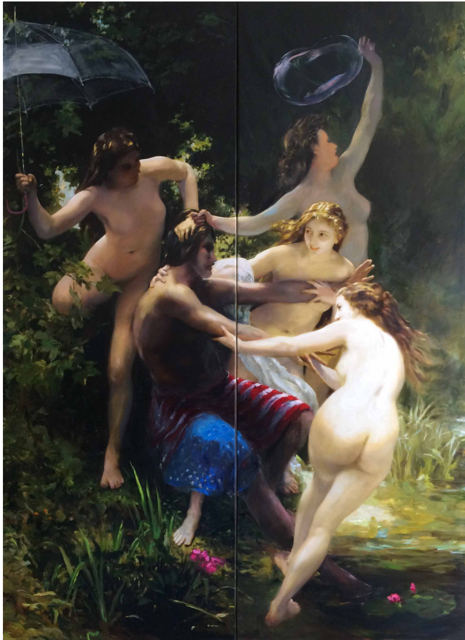
„Wooing The Empire“ (referring to Bouguereau) Öl auf Leinwand / oil on canvas 260 x 190 cm 2017