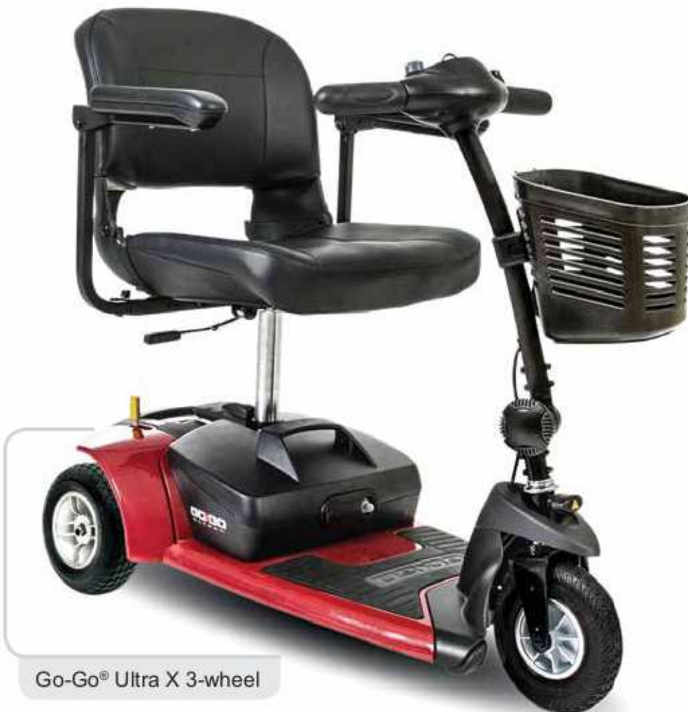
Go-Go ® Ultra X 3-wheel

The Go-Go ® Ultra X is loaded with features such as one-hand disassembly and a convenient drop-in battery box for worry-free travel. With a 260 lb. weight capacity, a maximum speed up to 4 mph, speeds up to 6.9 mph on the 3 wheel and 7.2 miles on the 4-wheel makes it an exceptional value.