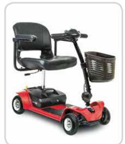
Go-Go ® Ultra X 4-wheel