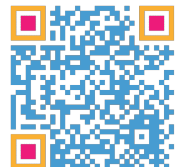
Tudalen Gwobr fyddar gyfeillgar