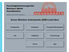
PC software DMI-Controller