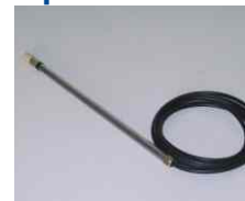
rel. humidity, air temp. approx. . 7,5 x 180 mm