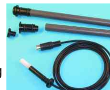
rel. humidity, air temp. for drilled holes \varnothing 8 mm