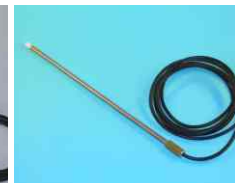
rel. humidity, air temp. approx. . 5,5 x 190 mm