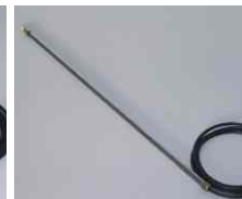
rel. humidity, air temp. approx. . 7,5 x 380 mm