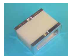
test module PE30