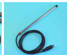
surface (wall) temp. approx. \varnothing 7,5 x 170 mm