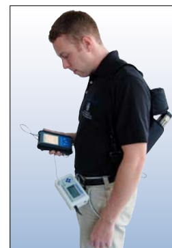
▲ Remotely access technicians' portable test meter data.