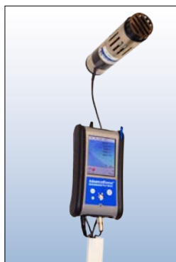
▲ Remotely access units set up for continuous monitoring.

The GrayWolfLive Control Panel automatically formats to fit the internet accessible device that you log in with (via your password protected account). Review information from GrayWolf instruments at one or multiple (unlimited) locations. Logged data can be displayed as "Details" (shows specifics about the location, min/max/avg, attached notes and latest log), "Graph" (shows 1 or more simultaneous trend graphs for logged data), "Data" shows logged info in tabular format and "Export" lets you import the data into GrayWolf's reporting software (on a Windows PC) for cut and paste reporting or optional, WolfSense ARG automated report generation. Alternatively, export the data as a .CSV file to any device. In addition, view "Realtime" readings accessed at approximately 30 second intervals, independent of the data-log interval. "Devices" allows you to remotely set units, alarm levels or other functions on specific GrayWolf instruments.